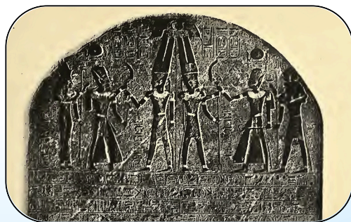
The Israel Stele

FACT: Just as no land of Palestine existed when Jesus was born, no people known as Palestinians existed. The Jews are the indigenous people of the land.