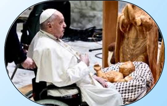
December 2024: Pope Francis at the Vatican with Jesus on a keffiyeh

The claim that Jesus was Palestinian contradicts all biblical and extra-biblical evidence that identifies Him as a practicing Jew, born in the Jewish homeland.