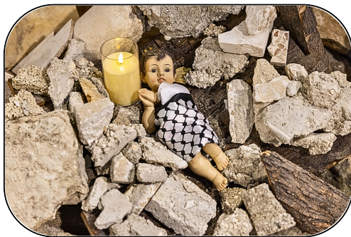
December 2023: "Jesus in the Rubble," Bethlehem