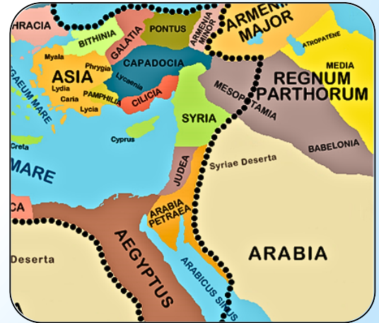
The Roman Empire in the Middle East during Jesus' lifetime: Judea. 30 CE

FACT: Just as no land of Palestine existed when Jesus was born, no people known as Palestinians existed. The Jews are the indigenous people of the land.