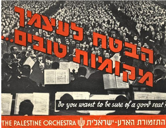
Palestine Orchestra signage written in Hebrew

FACT: Because the Jews of Palestine were known as Palestinians, Arabs living in the land emphasized their distinct identity as Arabs. This continued after the establishment of the State of Israel in 1948 until Yasser Arafat created the Palestinian identity in the 1960s for the purpose of propagating the political agenda that promotes Palestinian Arabs as the indigenous people of the land.