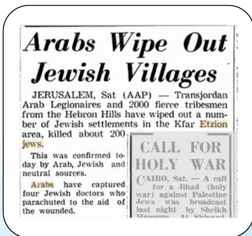
The Daily News, May 1948

The only expulsion of Arabs was from the twin towns of Lydda and Ramle because after accepting a ceasefire and promising to disarm, residents staged a violent uprising, forcing the IDF to conquer the towns. 4