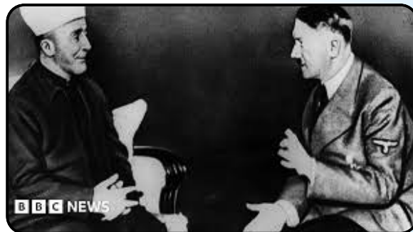
Grand Mufti of Jerusalem, Amin al-Husseini, with Adolf Hitler November 28, 1941

Palestinian Arab leaders continued to decline offers of a Palestinian state as recently as 2008. 11